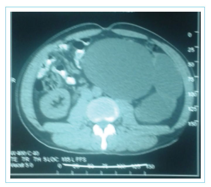
Figure 2. Tomografi image.